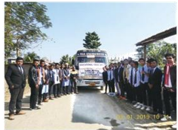
Educational Tour 2019