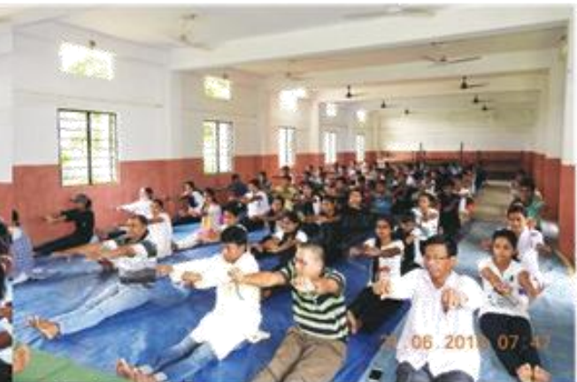
Observance of International Day of Yoga 2018