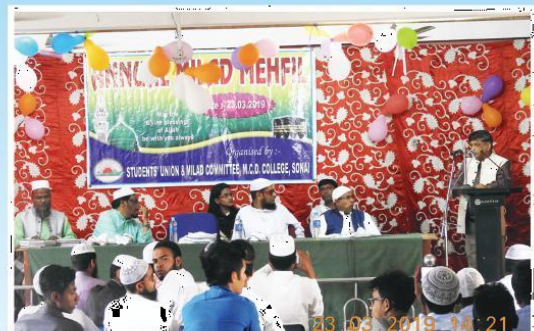
Annual Milad Mehfil 2019