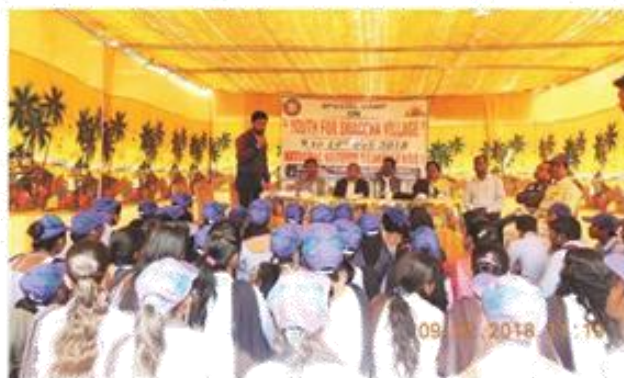
Special Camp of NSS