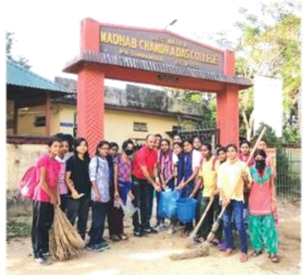
Swachh Bharat Abhijan by NCC female wings

The college maintains a high standard of discipline. The students must abide by the rules and regulations prescribed by the college authority. Any violation of college rules & regulations will invite strict disciplinary action such as forced transfer, non-issuing of college certificates or any other punishment the authority deems fit and proper. The principal's decision shall be final and binding on all.