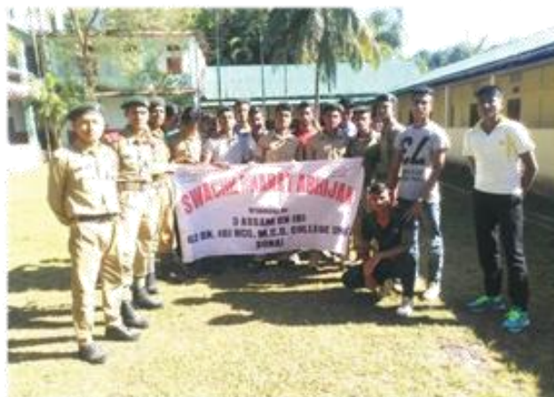
Swachh Bharat Abhijan by NCC Boys wings