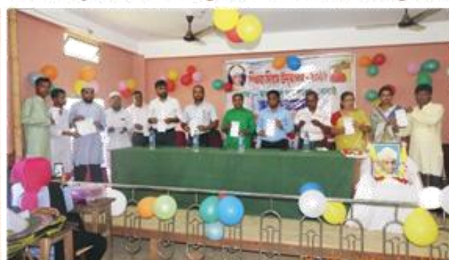
Releasing of 'Echchenodi'