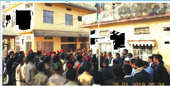
Republic Day Observation 2019