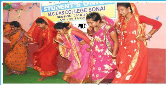
Freshers Meet 2018