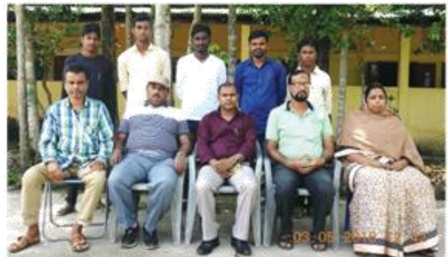
Office Staff (Non-teaching)