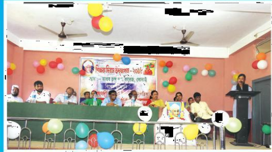
Teachers day Celebration 2018