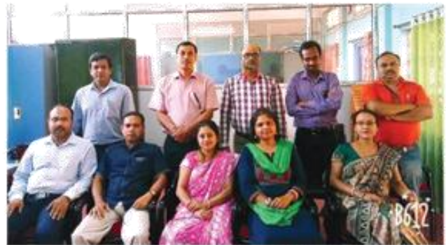
Science & Commerce Faculty