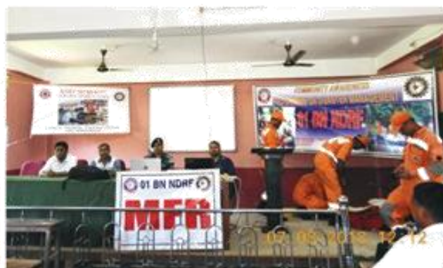
Community Awareness Programme on Disaster Management