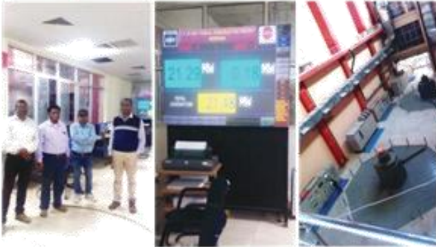
Educational Tour 2019 at Tuirial Hydroelectric Project Mizoram