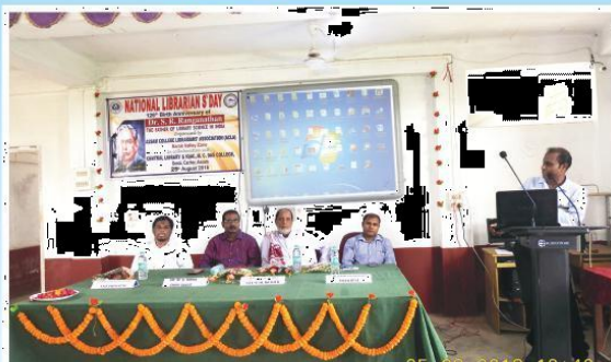
Librarians Day Celebration 2018