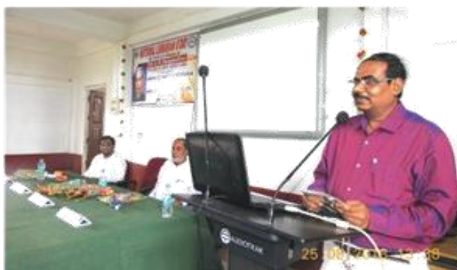
Librarians Day Celebration