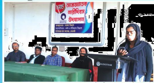
International Womens Day Celebration