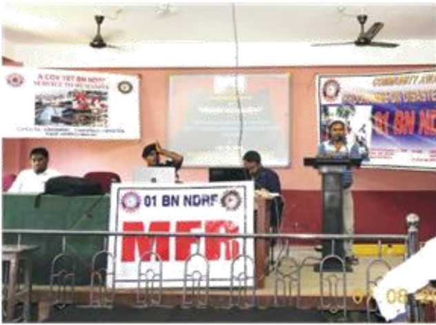
Community Awareness Programme on Disaster Management