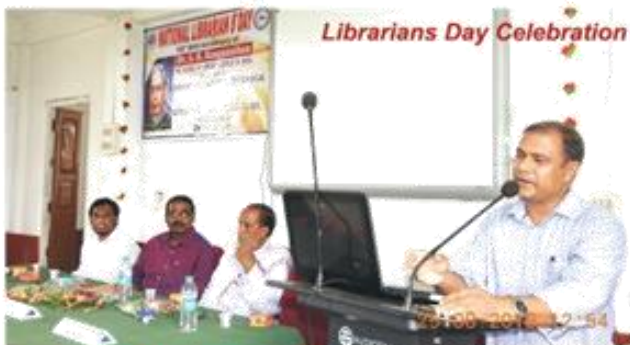
Librarians Day Celebration