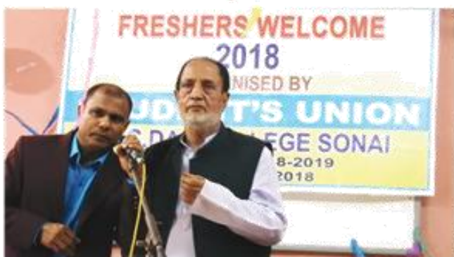
Freshers Meet 2018