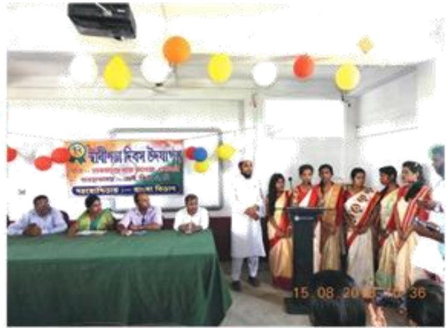
Independence Day Observation