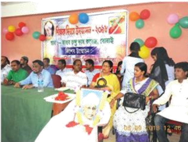
Teachers day Celebration 2018