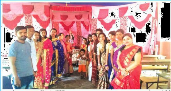
Saraswati Puja 2019