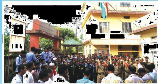
Independence Day Observation 2018