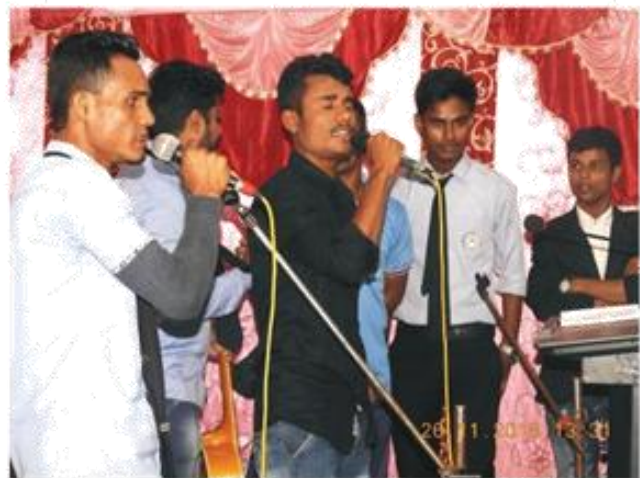
Freshers Meet 2018